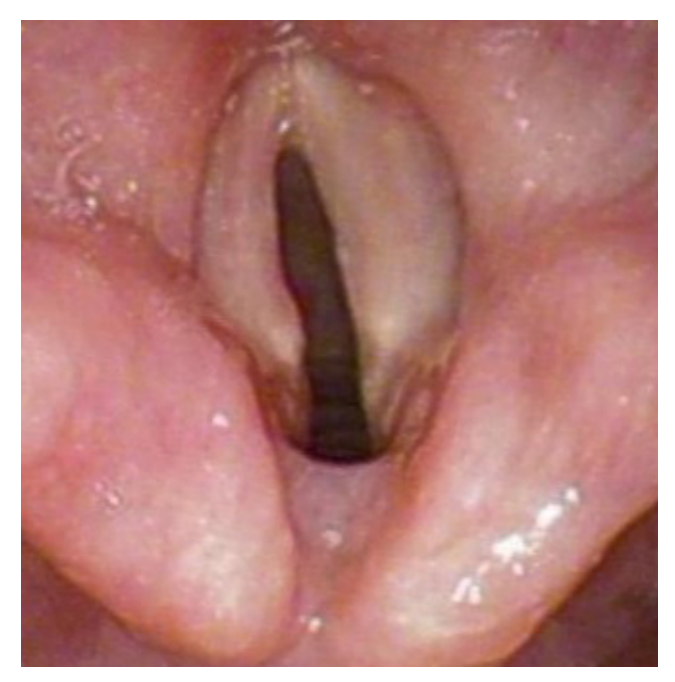
Figure 4. Bilateral paralysis of the vocal folds [20]

narrowing of the airways of this patient by about 75%. The patient suffers from severe dyspnoea at rest.